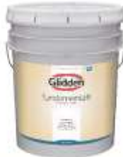
5 GAL. GLIDDEN INTERIOR PAINT