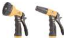
2 PC. ADJUSTABLE NOZZLE SET