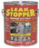
1 GAL. LEAK-STOPPER RUBBERIZED ROOF PATCH