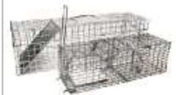
2 PC. LIVE ANIMAL TRAP