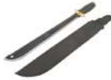
18" MACHETE SAW W/SHEATH