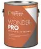
1 GAL. PPG WONDER-PRO EXTERIOR PAINT