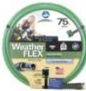
50' MEDIUM DUTY GARDEN HOSE