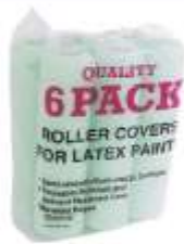
6 PACK ROLLER COVERS