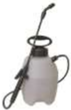
1 GAL. HOME AND GARDEN POLY TANK SPRAYER