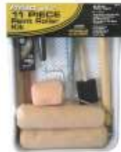
11 PC. PAINT TRAY SET