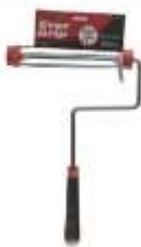
5-WIRE NON-SLIP ROLLER FRAME