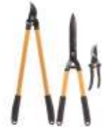
3 PC. PRUNER SET