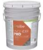
5 GAL. WONDER-PRO EXTERIOR PAINT