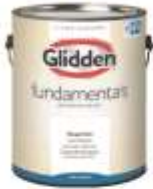
1 GAL. GLIDDEN INTERIOR PAINT