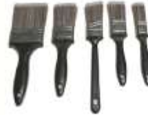
5 PC. BRUSH SET