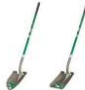
47" FIBERGLASS SQUARE OR ROUND SHOVEL